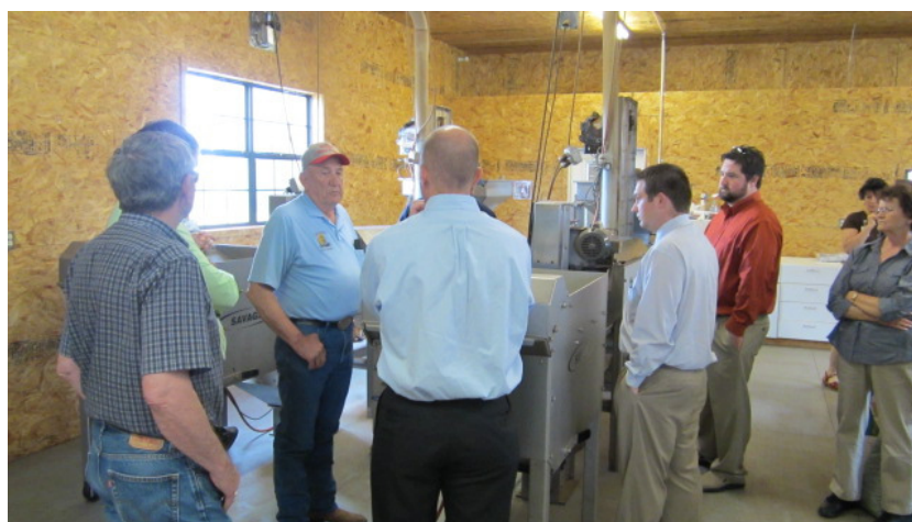
In March, Class 2 visited Hoffman Pecan Farm near Ripley