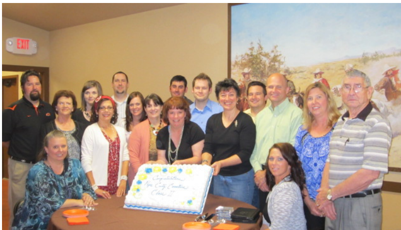
Class 2 poses with a cake donated by Meridian Technology Center.